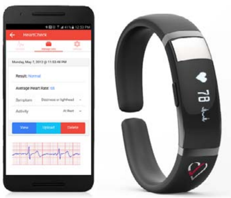
HEARTCHECK™ EKG LIFEBAND

“We are entering into new and innovative markets on how to monitor people and we are solidifying our presence in the existing well-established wellness markets that we have been absent from. We are an enabling connectivity company, as such; we will not focus on making our own devices, that’s not our strength. We are a hardware-enabling connectiv-